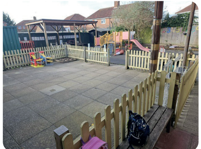
The garden before

Thank you Megan for providing an example of how early years pupil premium funding can be used creatively to support children’s learning and development.