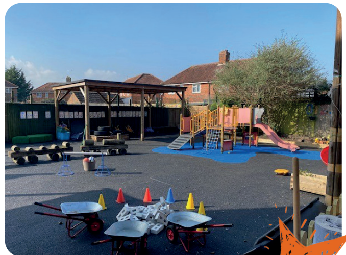
The garden after